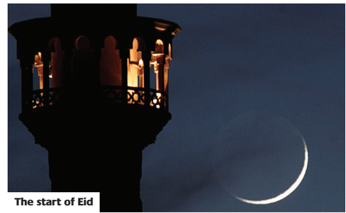
The start of Eid