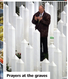
Prayers at the graves