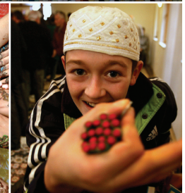
Fireworks for Eid